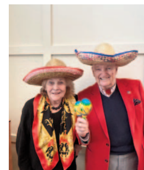
Cinco de Mayo

Saturday, May 3, Kentucky Derby Social: join us for an afternoon of Southern charm as we celebrate the "Most Exciting Two Minutes in Sports!" We'll enjoy classic mint juleps, light hors d'oeuvres, and festive Derby decor. Don your best hat and cheer for your favorite horse!