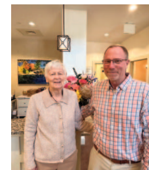
Happy Mother's Day

Monday, May 5th, We'll celebrate Cinco de Mayo with lively music, colorful decorations, delicious Mexican -inspired appetizers, and margaritas!